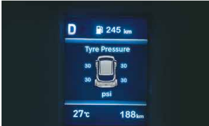
Tyre pressure monitoring system (TPMS) - highline