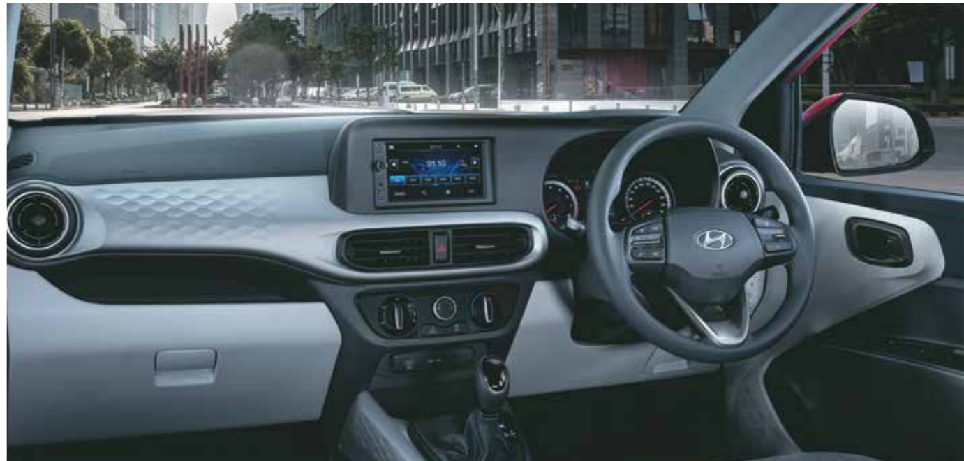
Dual tone grey interiors

Take control of your commute with the Grand i10 Nios corporate trim. Meticulously crafted to enhance your drive while exuding an executive presence. Experience the convergence of technology and design that features a monochromatic black interior punctuated by strategically placed red accents, and gleaming chrome details.