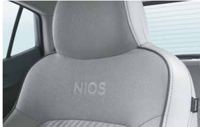
Semi fabric seat with piping