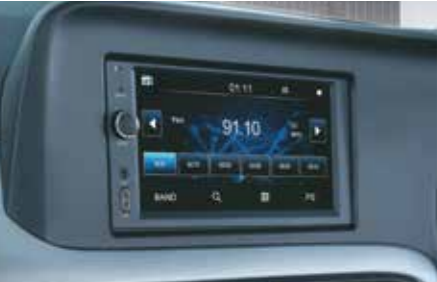
17.14cm (6.75") touchscreen display audio

Other features: 3 Point seat belts (All seats) | Seat belt reminder (All seats) | Headlamp escort system Burglar alarm | TPMS - highline | 6 Airbags