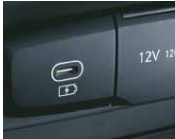
Fast USB charger (Type C)