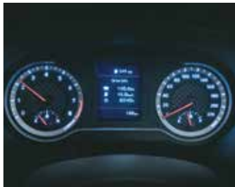
8.89 cm (3.5") speedometer with multi info display