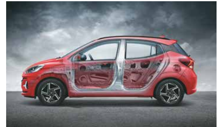
Strong built structure

Other features: Child seat anchor (ISOFIX) | Driver rear view monitor (DRVM) | Speed alert system | Front seatbelt pretensioner with load limiters | Burglar alarm Rear defogger | Impact sensing auto door unlock | Speed sensing auto door lock | Headlamp escort system | Emergency stop signal