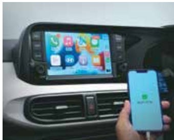
Apple CarPlay and Android Auto