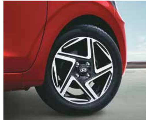
R15 (D=380.2 mm) diamond cut alloy wheels