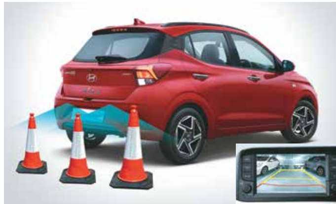
Rear parking camera with display on audio