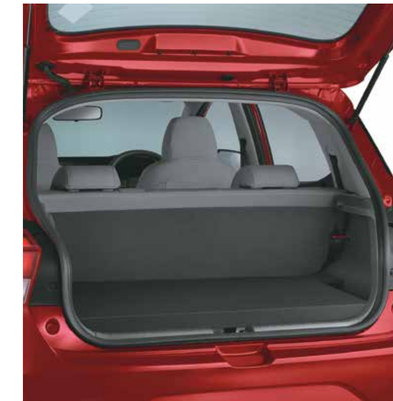
Spacious boot with company-fitted dual cylinder CNGt

Hyundai Grand i10 NIOS Hy-CNG duo is engineered to optimize every journey. Equipped with a dual-cylinder system, it offers more boot space and fuel efficiency. It ensures you have all the room you need for your adventures while delivering exceptional performance.