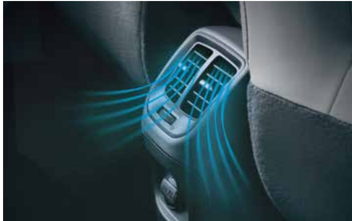
Rear AC vent