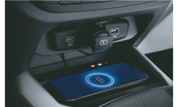
Wireless phone charger*