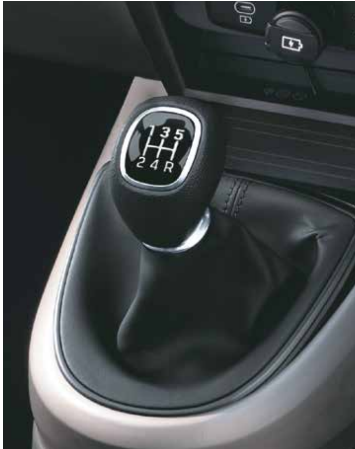
Manual transmission (MT)