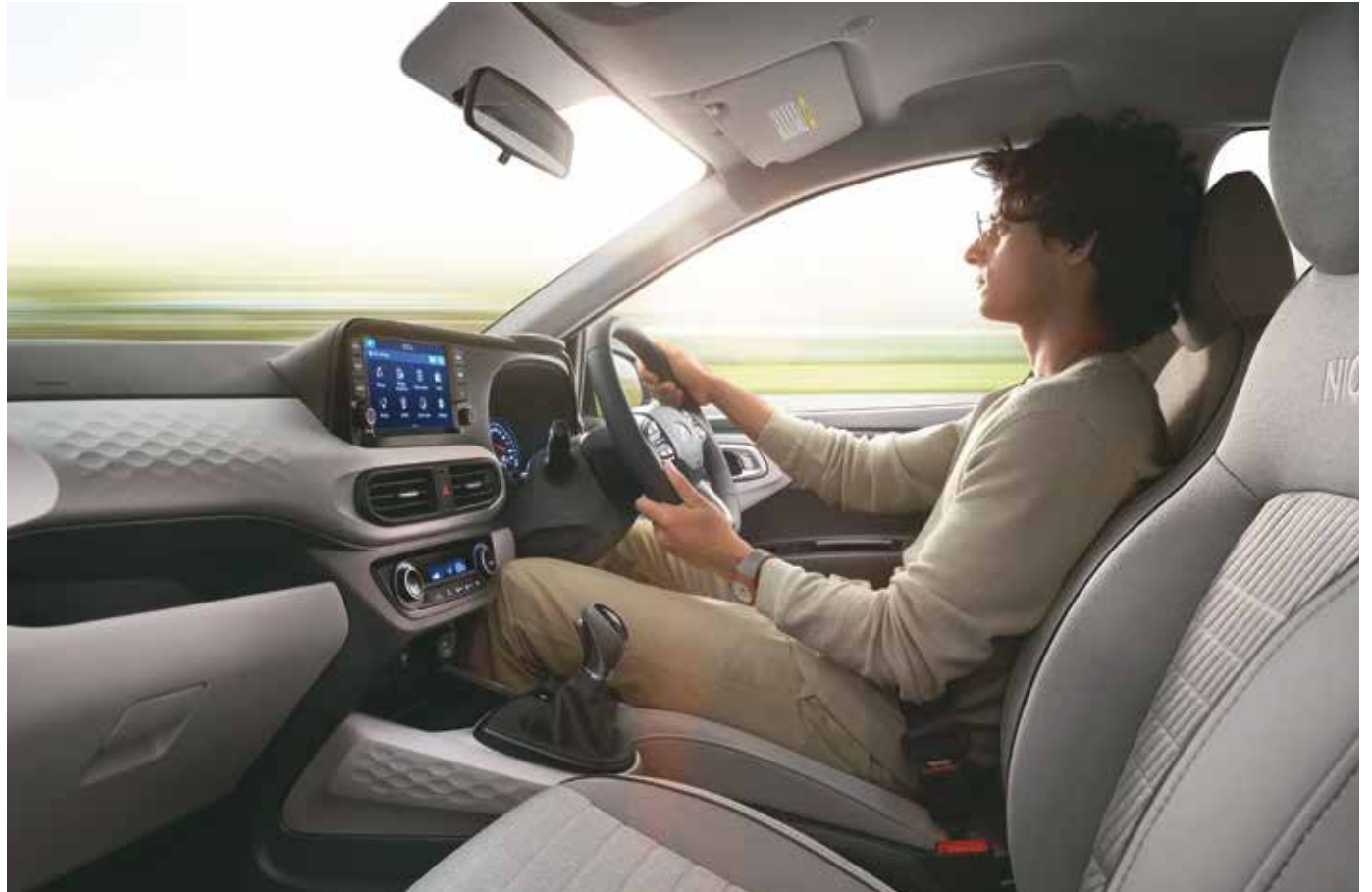
Dual tone grey interior

Other features: Steering mounted audio & bluetooth controls