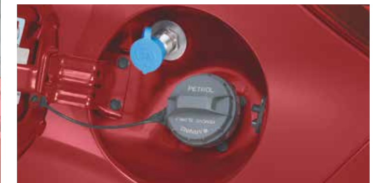
Convenient CNG filling with fast refuelling nozzle (near petrol filling area)