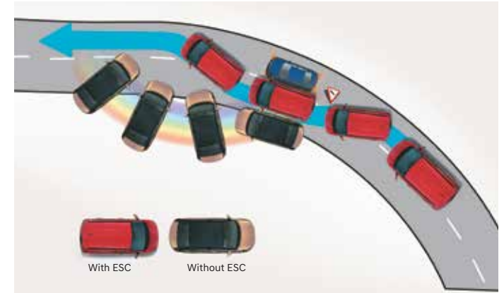
Electronic stability control (ESC) Vehicle stability management (VSM)