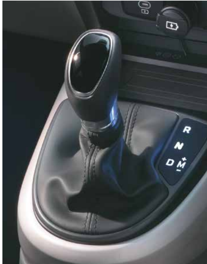
Automated manual transmission (AMT)