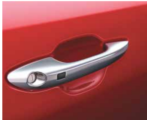
Chrome outside door handles