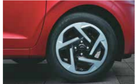
R15 (D = 380.2mm) Dual tone styled steel wheel