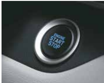
Smart key with push button start/stop