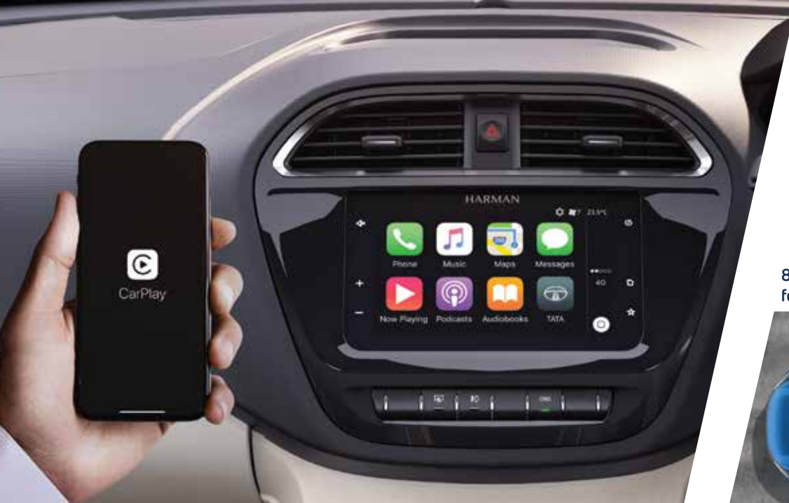
Apple Carplay™ and Android Auto™ Connectivity