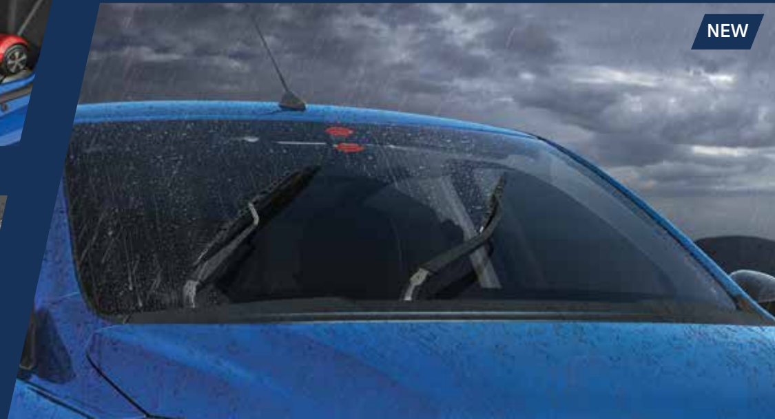
Rain Sensing Wipers